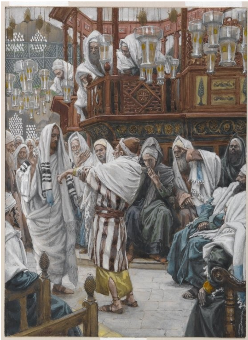
The Man with the Withered Hand

June 3, 2018, 8:00 and 10:30 am Worship Services