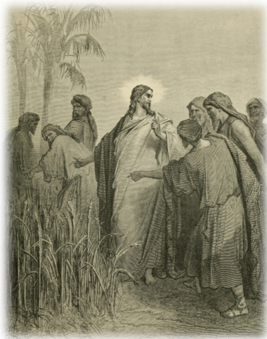
The Disciples Plucking Corn on the Sabbath.